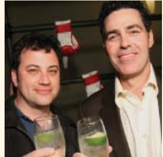
Hosted by Jimmy Kimmel & Adam Carolla